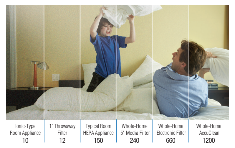
Ratings of cubic feet per minute of clean air delivered for a typical 3-ton heating and cooling system: the higher the value, the more effective the air cleaner.

Want 99.98% clean air? Then choose the home air filtration system that gives 110% – American Standard's revolutionary AccuClean.™ By removing up to 99.98% of unwanted allergens down to .1 micron from the filtered air, AccuClean is 100 times more effective than a standard 1" throwaway filter. Simply put, AccuClean works harder, so you and your family can breath easier.